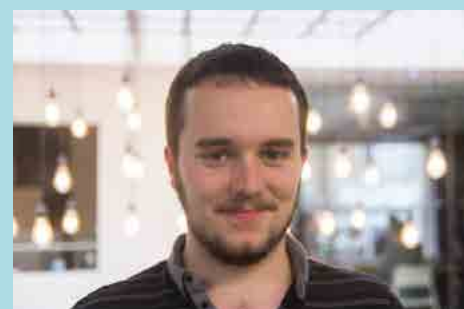
Top: Durham University

The continuity of the Club inevitably lies in the watchfulness of the longer-term members of the Lodge, but the preference is for students to take the lead in organising its events. It has been very successful, both in promoting a sense of fellowship among the younger members of the Lodge, and in securing candidates for initiation 'with a favourable opinion preconceived'.