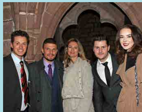
Top: Ecumenical service, Chester Cathedral