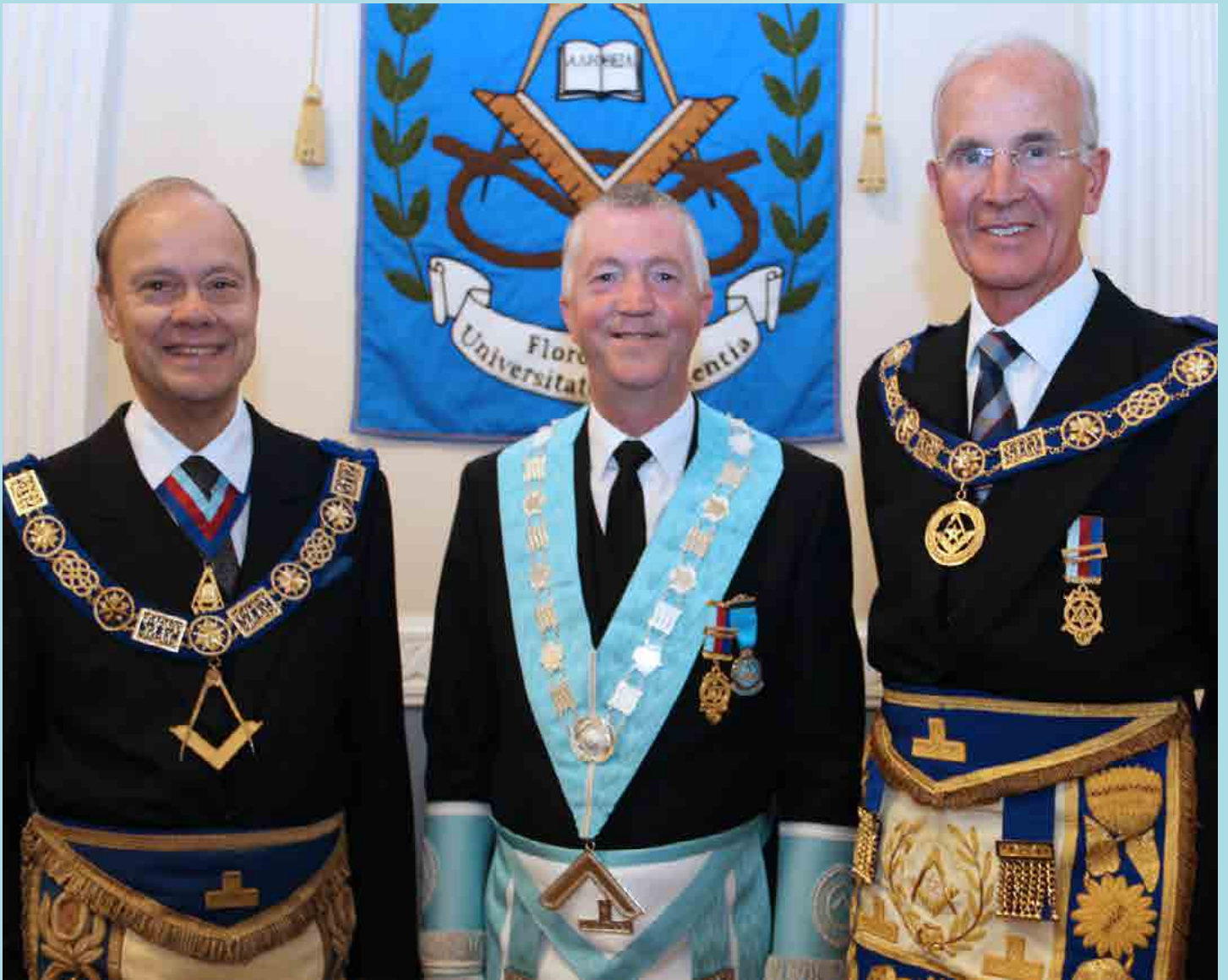
Above: The Consecration of Universities Lodge No. 9907