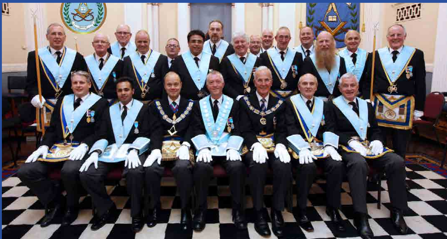
Below: The Consecration of Universities Lodge No. 9907

The route we have taken I believe has much to recommend it and I would heartily recommend the same to anyone interested in creating their own scheme lodge in the future as having clear advantages.